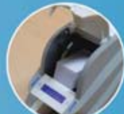
Front Card In / Out