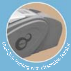
Dual-Side Printing with attachable Rotator