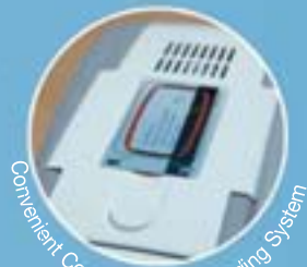
Convenient Contactless IC Encoding System