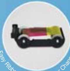
Easy Ribbon & Cleaning Roller Change