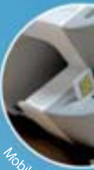
Mobile IC Encodi