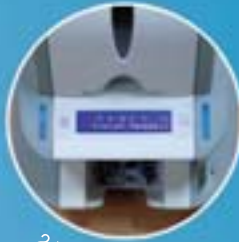
2 Lines LCD & LED